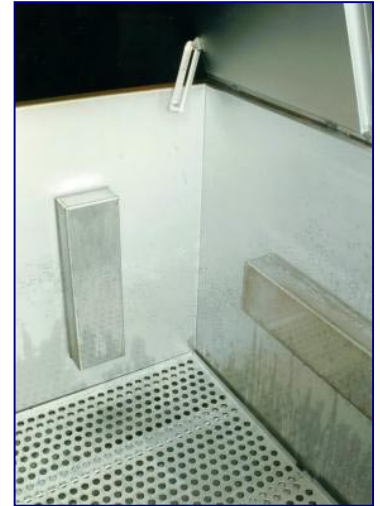
Ultrasonic bath with transducers fitted to the wall

This energy produces a powerful cleaning effect that is able to remove stubborn contamination, even in spaces that are hard to reach, drastically shortening the cleaning time. It is therefore extremely suited for cleaning a.o. air coolers, fuel and lubrication oil filters, radiators (only the air side), Boll & Kirch filters, hydraulic filters.